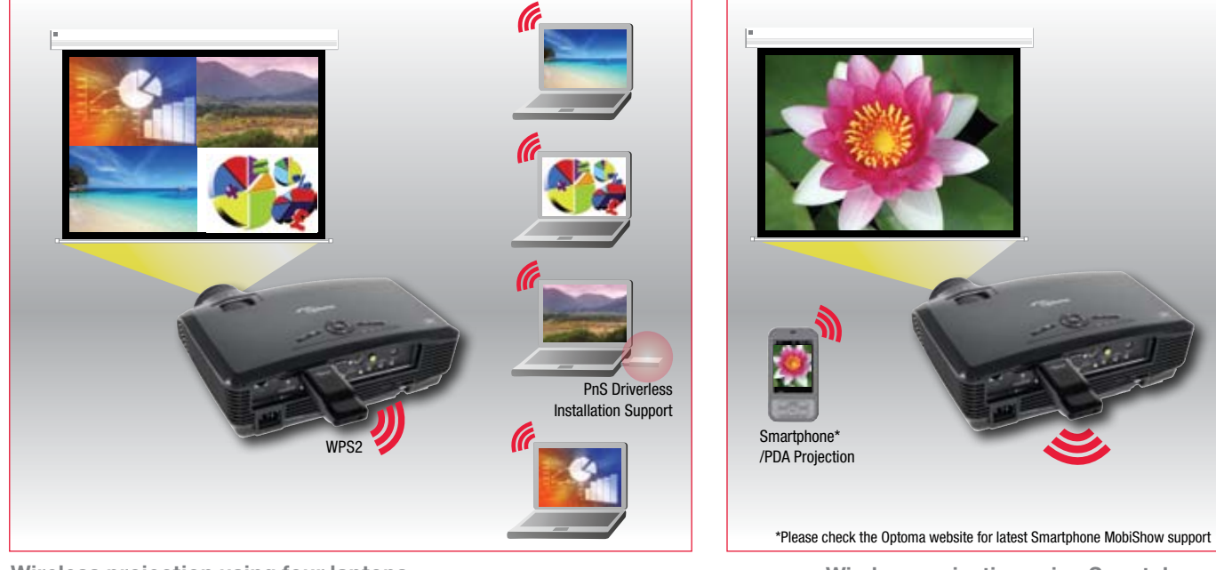
Wireless projection using four laptops